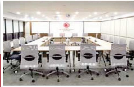
2 可容納超過70人 Max capacity up to 70 persons