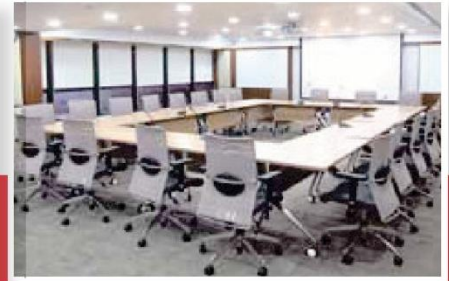
3 會員租借場地七折優惠 Member exclusive discount at 30%